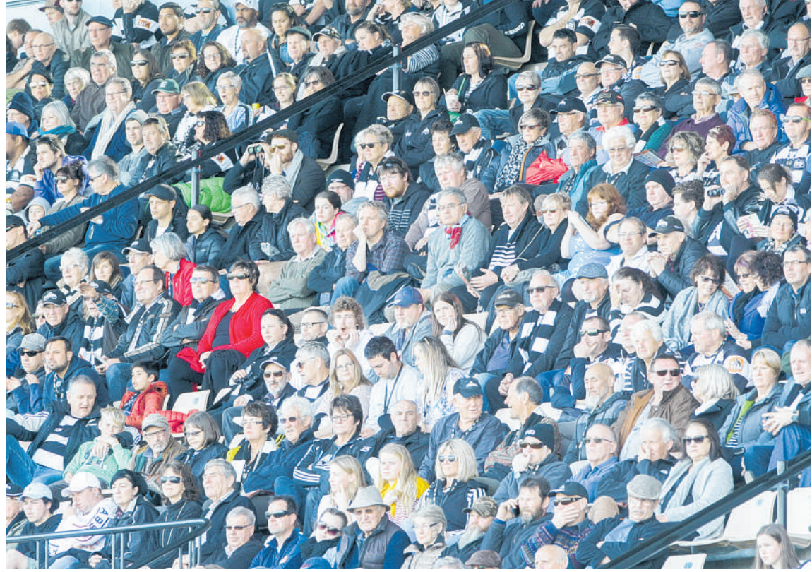
Packing McLean Park in Napier for a Hawke's Bay-Counties Manukau match in 2018. The unions meet at the park on August 12 in the Magpies' first home NPC game of 2022.